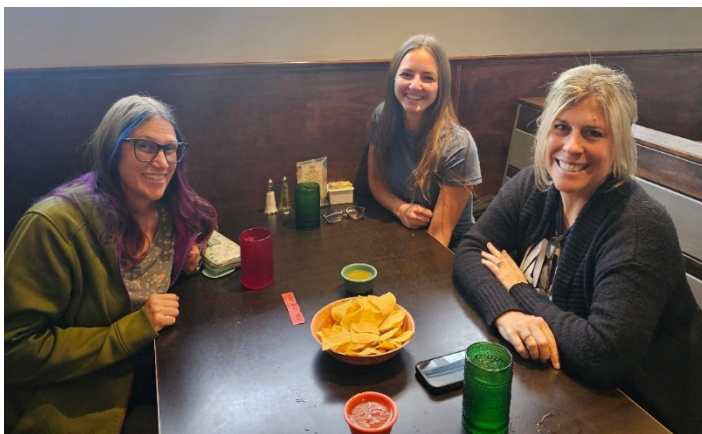
And finally, on to our End of School luncheon and the announcement of our