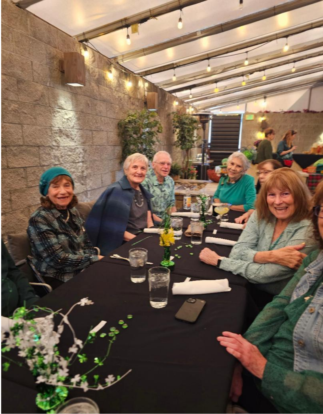
Members having a great time, good food, and wonderful conversations.

Then it was on to Taco Tuesday at Tacos Tijuana to celebrate Cinco de Mayo.